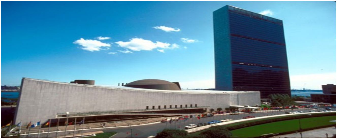
UNITED NATIONS HEAD QUARTERS, NEW YORK

ETHIOPIA AFRICA BLACK INTERNATIONAL CONGRESS